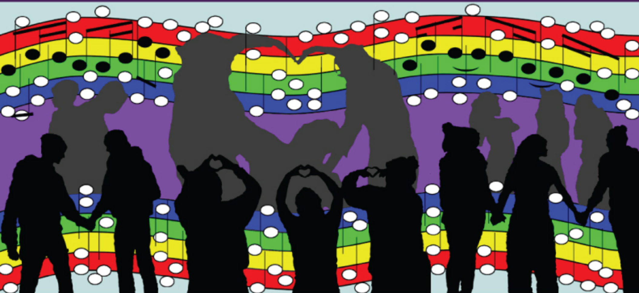
Expressive Arts Therapy - Bill Wilson Center mural